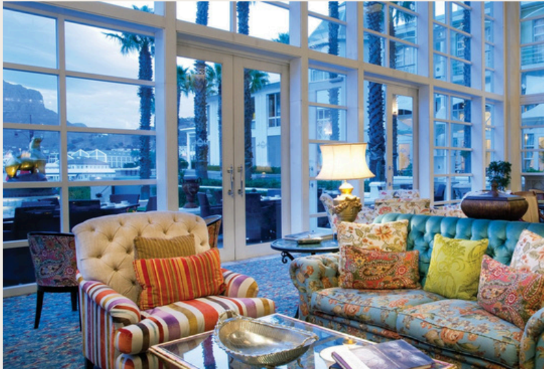
Table Bay Hotel

Inspired by the boundless creative energy of the city that it calls home, The Table Bay offers unrivalled Victoria and Alfred Waterfront accommodation which celebrates Cape Town's colourful cultural heritage, evocative romance and irresistible spirit of adventure. Straddling the working V&A harbour and vibrant city bowl beneath the majestic zenith of Table Mountain, The Table Bay enjoys the best address in Cape Town, and invites you to discover an authentic South African 5-star experience in the Mother City.